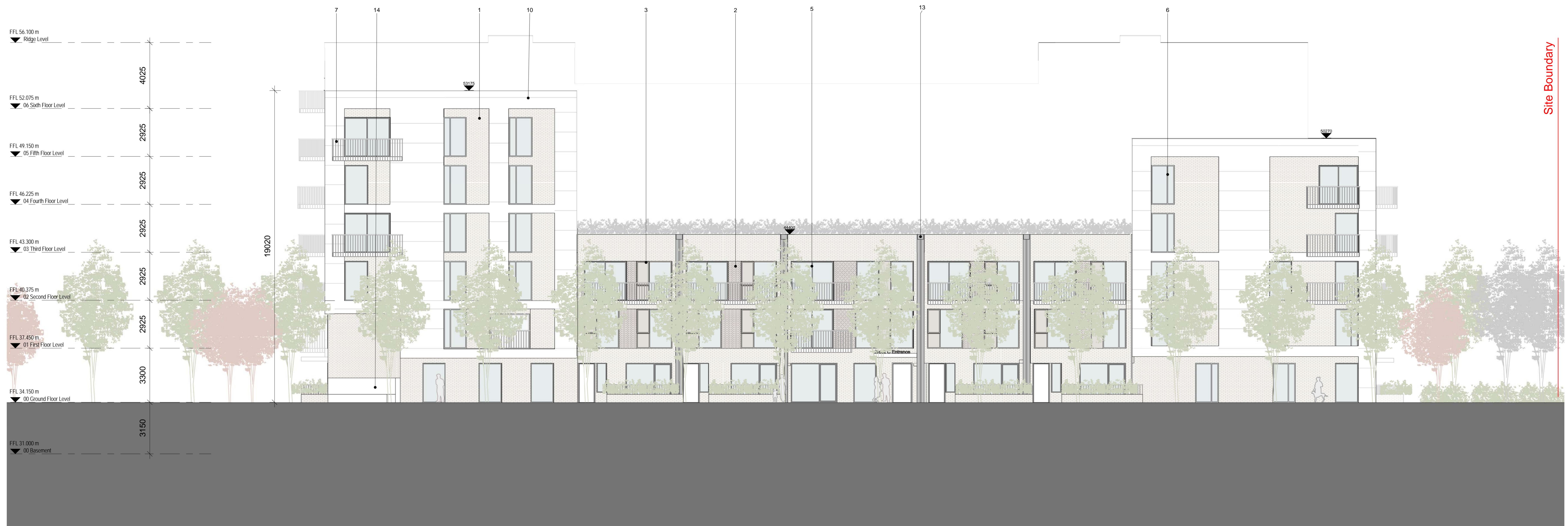
1 Elevation SW 1 : 100